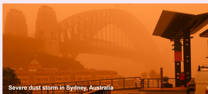
Severe dust storm in Sydney, Australia